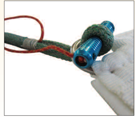
Dogbone used to terminate a sheet