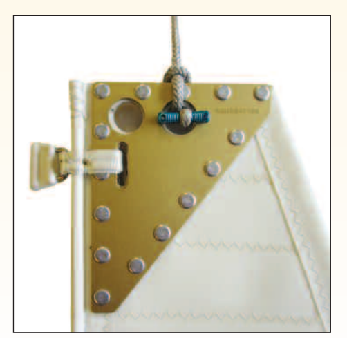
Dogbone as Halyard

Available in seven different sizes from 6mm to 18mm