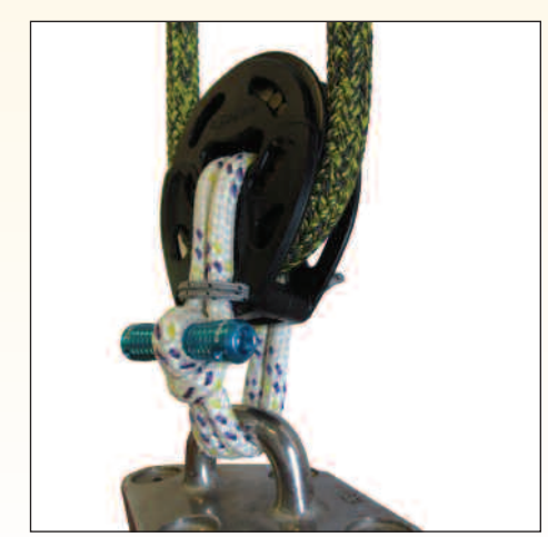
Dogbone on loop to connect block